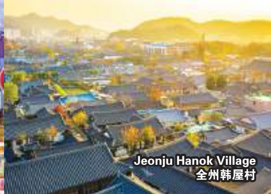
Jeonju Hanok Village 全州韩屋村