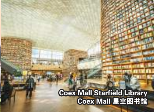
Coex Mall Starfield Library Coex Mall 星空图书馆