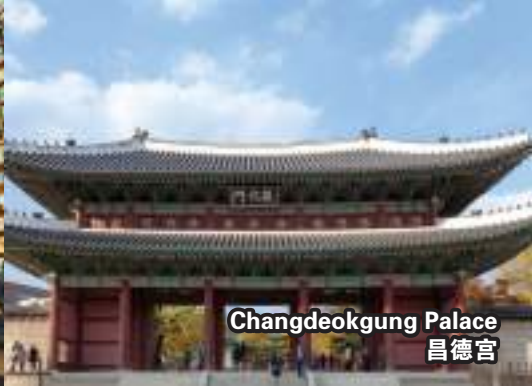
Changdeokgung Palace 昌德宫