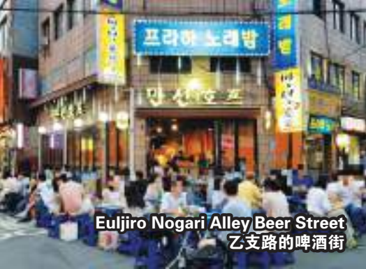
Euljiro Nogari Alley Beer Street 乙支路的啤酒街