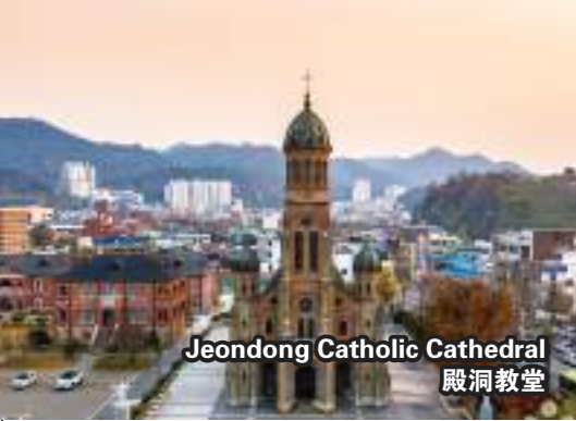
Jeondong Catholic Cathedral 殿洞教堂