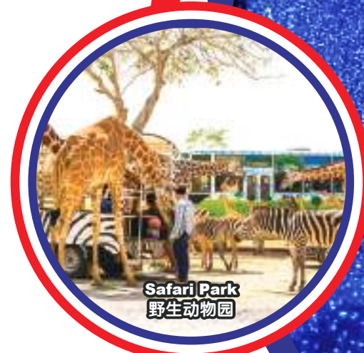
Safari Park 野生动物园

行程次序，以當地旅社安排為準。 Sequences of Itinerary are subject to local arrangement.