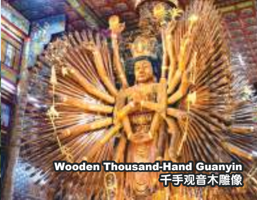
Wooden Thousand-Hand Guanyin 千手观音木雕像