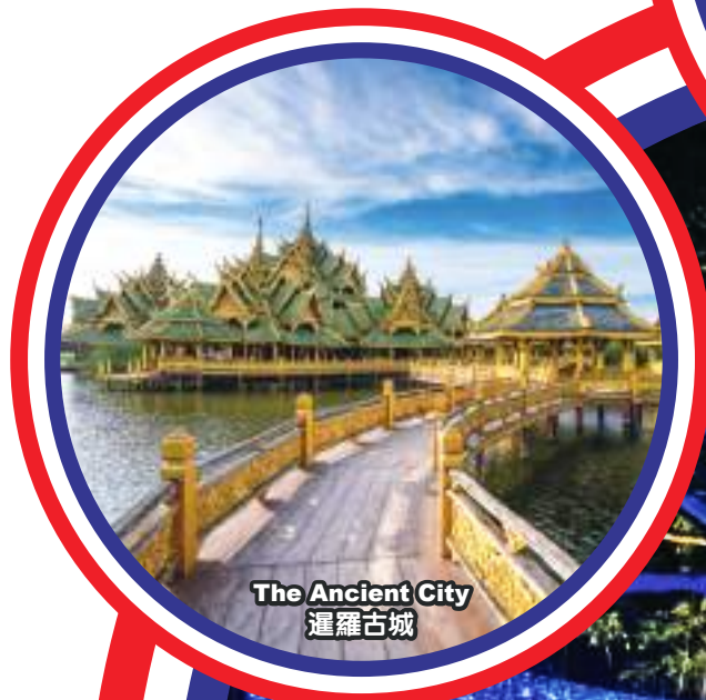
The Ancient City 暹羅古城