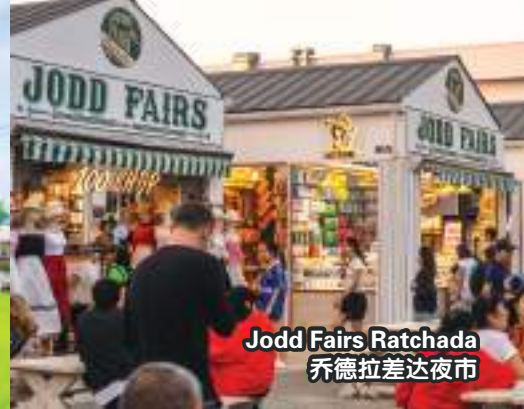
Jodd Fairs Ratchada 乔德拉差达夜市