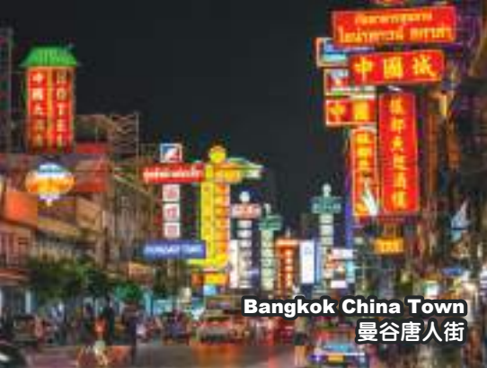
Bangkok China Town 曼谷唐人街