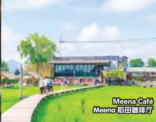
Meena Café Meena 稻田咖啡厅