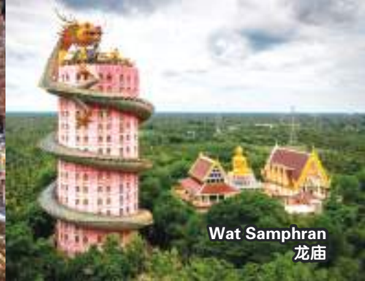
Wat Samphan 龙庙