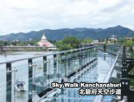
Sky Walk Kanchanaburi 北碧府天空步道