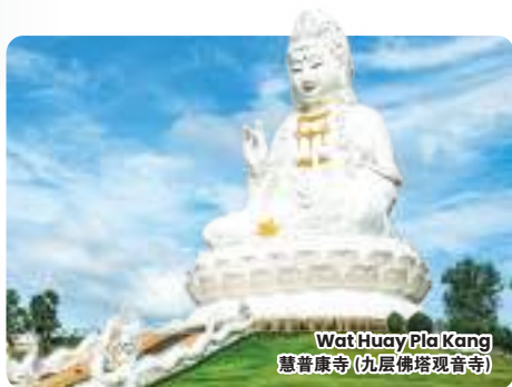
Wat Huay Pla Kang 慧普康寺 (九层佛塔观音寺)