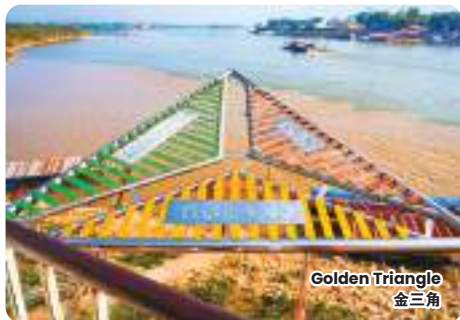
Golden Triangle 金三角