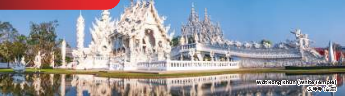
Wat Rong Khun (White Temple) 龙坤寺 (白庙)