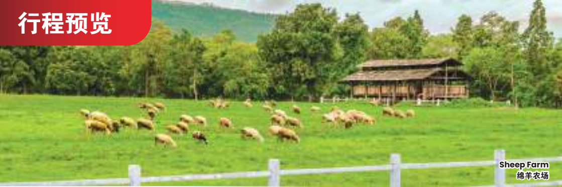
Sheep Farm 绵羊农场