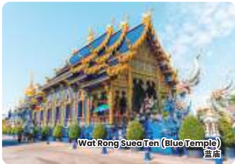
Wat Rong Suea Ten (Blue Temple) 蓝庙

免责声明: 由于新冠肺炎疫情旅行限制当地/宗教节日、公众假期、天气状况、交通等情况, 自然灾害, 必要时黄金旅程保留对行程进行适当调整 (调整景点游览顺序) 以确保行程顺利进行, 会或否事先通知。