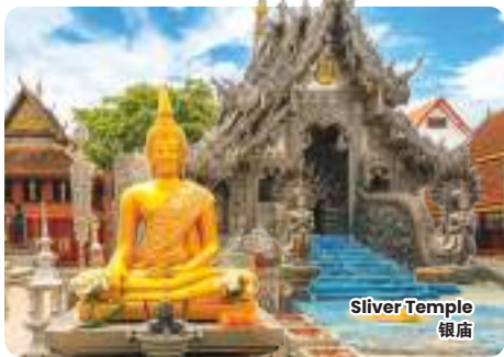
Silver Temple 银庙