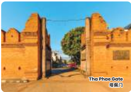
Tha Phae Gate 塔佩门