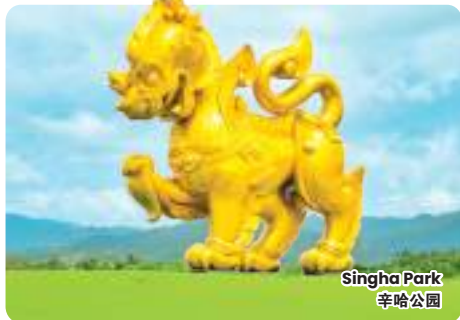
Singha Park 辛哈公园