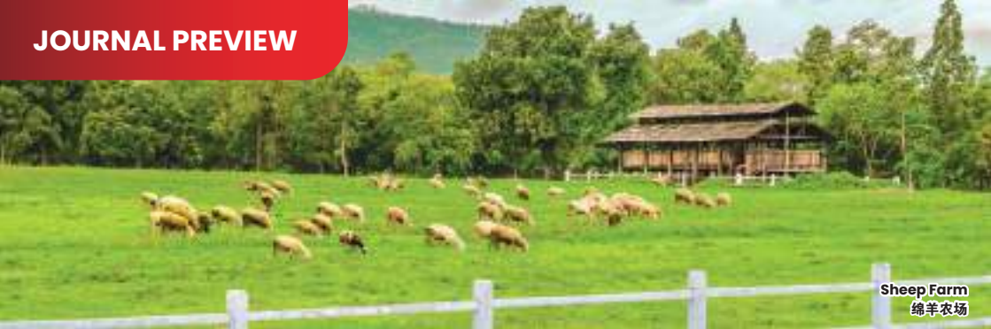
Sheep Farm 绵羊农场