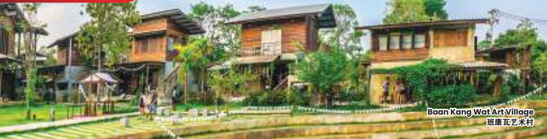
Baan Kang Wat Art Village 班康瓦艺术村