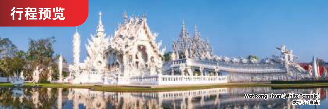
Wat Rong Khun (White Temple) 龙坤寺(白庙)