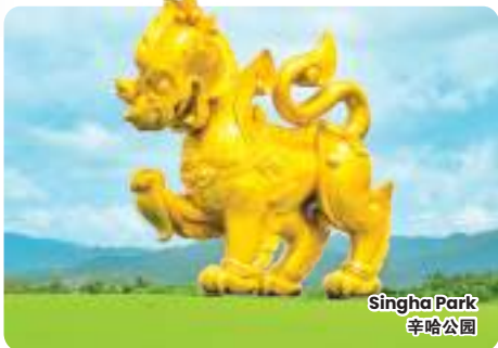
Singha Park 辛哈公园

免责声明：由于新冠肺炎疫情旅行限制当地/宗教节日、公众假期、天气状况、交通等情况，自然灾害，必要时黄金旅程保留对行程进行适当调整（调整景点游览顺序）以确保行程顺利进行，会或否事先通知。