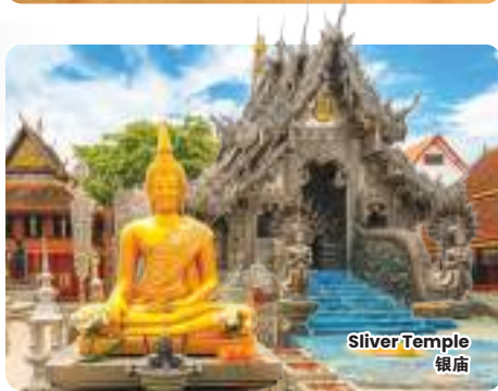
Silver Temple 银庙