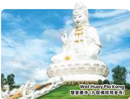
Wat Huay Pla Kang 慧普康寺(九层佛塔观音寺)