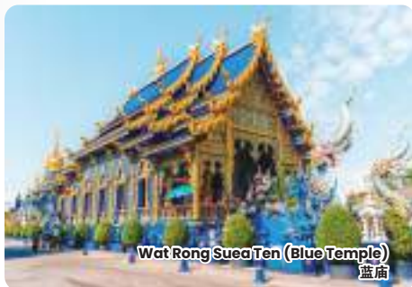
Wat Rong Suea Ten (Blue Temple) 蓝庙

Disclaimer: Due to Covid-19 travel restrictions, local / religious festivals, public holidays, weather condition, transport technical issue, acts of nature, Golden Destinations reserved the right to alter the sequence or change, amend or alter the itinerary if necessary, with or without prior notice.