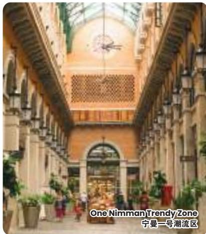
One Nimman Trendy Zone 宁曼一号潮流区