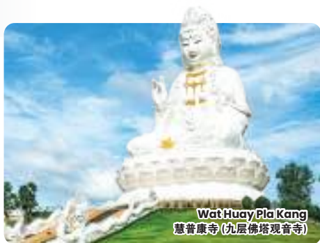
Wat Huay Pla Kang 慧普康寺 (九层佛塔观音寺)