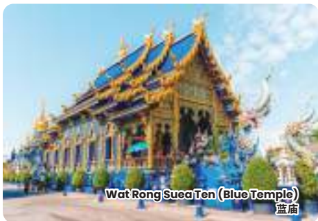
Wat Rong Suea Ten (Blue Temple) 蓝庙

免责声明: 由于新冠肺炎疫情旅行限制当地/宗教节日、公众假期、天气状况、交通等情况, 自然灾害, 必要时黄金旅程保留对行程进行适当调整 (调整景点游览顺序) 以确保行程顺利进行, 会或否事先通知。