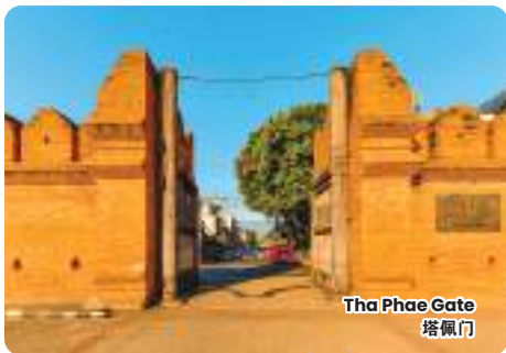
Tha Phae Gate 塔佩门