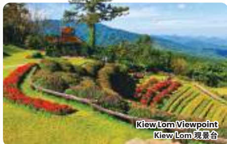
Kiew Lom Viewpoint Kiew Lom 观景台