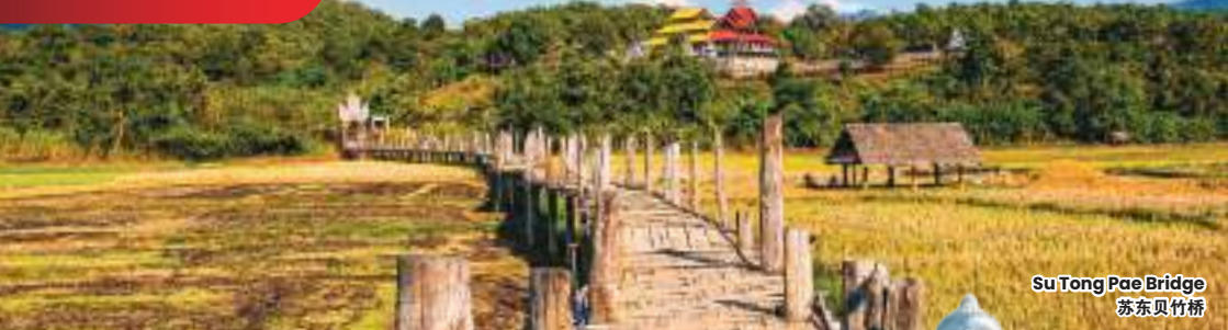
Su Tong Pae Bridge 苏东贝竹桥