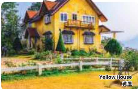
Yellow House 黄屋