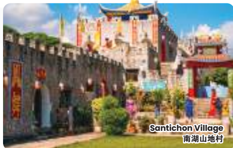
Santichon Village 南湖山地村