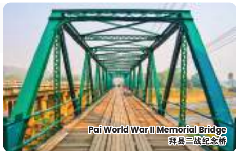
Pai World War II Memorial Bridge 拜县二战纪念桥