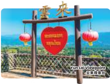
Yun Lai Viewpoint 云来观景台