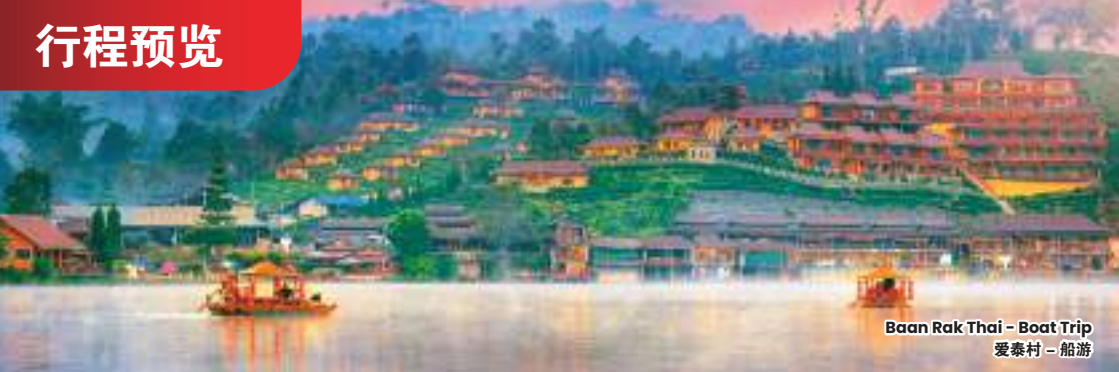
Baan Rak Thai - Boat Trip 爱泰村 - 船游