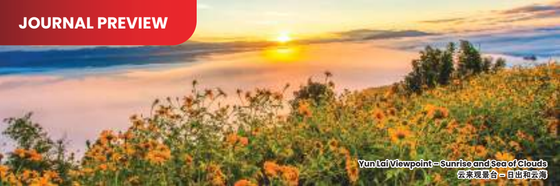
Yun Lai Viewpoint – Sunrise and Sea of Clouds 云来观景台 – 日出和云海