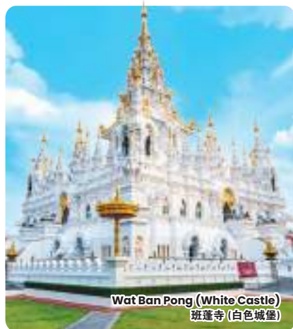
Wat Ban Pong (White Castle) 班蓬寺 (白色城堡)