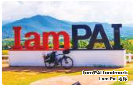
I am PAI Landmark I am Pai 地标