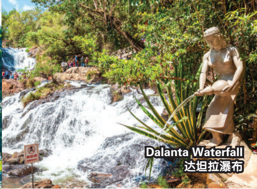
Dalanta Waterfall 达坦拉瀑布