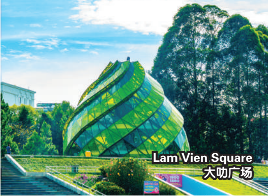
Lam Vien Square 大叻广场