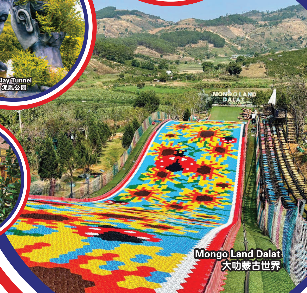
Mongo Land Dalat 大叻蒙古世界