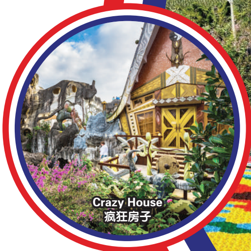
Crazy House 疯狂房子