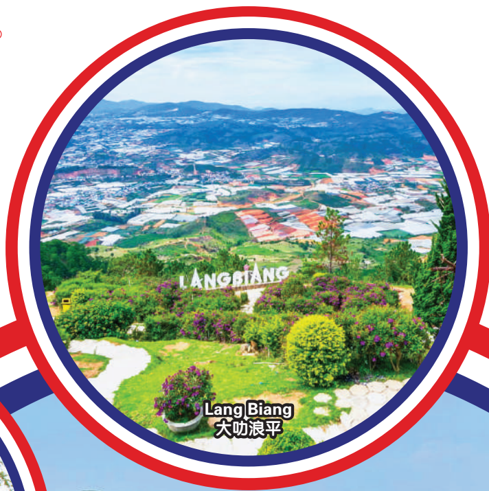
Lang Biang 大叻浪平