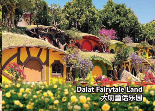
Dalat Fairytale Land 大叻童话乐园