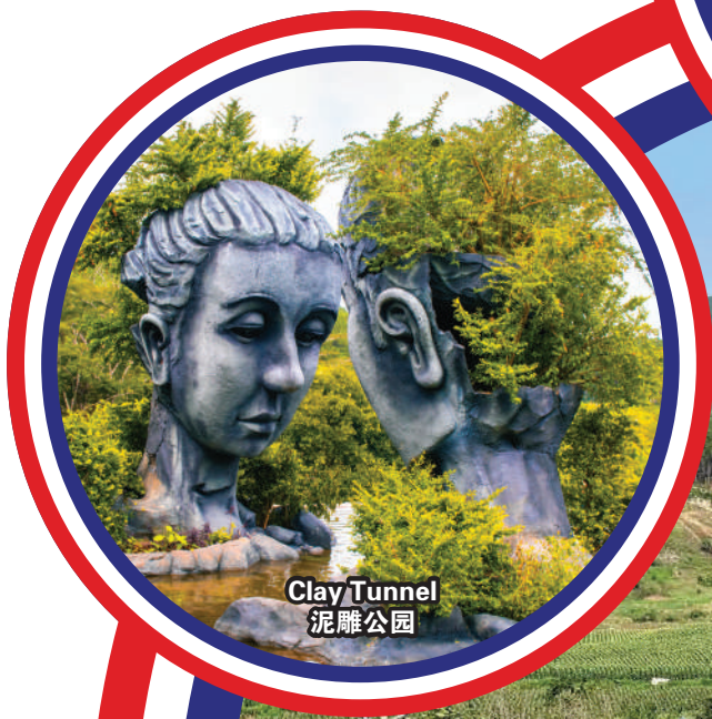
Clay Tunnel 泥雕公园